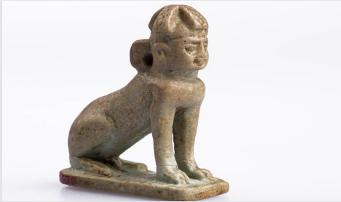
Female Sphinx amulet, Egyptian, Late Period