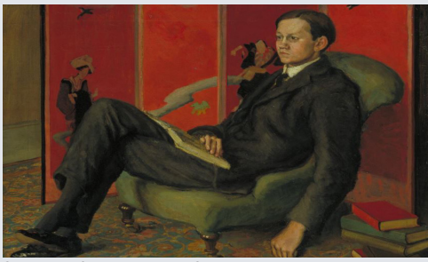
James Strachey by Duncan Grant, 1910

The artworks in the exhibition address these ideas, creating a conversation that reverberates throughout the evocative rooms of the Freud Museum. The archival presentation, explores the prehistory of the journal, the hidden role of women in its early years, its beginnings and connections with the Bloomsbury Group , and the influence of classical art and culture on Freud's ideas and the visual identity of The International Journal .