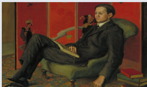
James Strachey by Duncan Grant, 1910

The artworks in the exhibition address these ideas, creating a conversation that reverberates throughout the evocative rooms of the Freud Museum. The archival presentation, explores the prehistory of the journal, the hidden role of women in its early years, its beginnings and connections with the Bloomsbury Group , and the influence of classical art and culture on Freud's ideas and the visual identity of The International Journal .